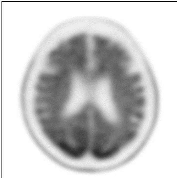
Figure 3. Positive Amyloid Scan. This PET/CT scan is positive for significant amyloid in the brain. The radiopharmaceutical (black) accumulates in both the white and gray matter, with distribution out to the periphery of the brain. This scan is consistent with Alzheimer’s disease.

Still, there are several clinical situations in which florbetapir scans have potential utility. One is when a patient exhibits findings of AD at a younger-than-expected age (such as a patient with a presenilin-1 mutation). A second is to determine if a patient with mild cognitive impairment who does not meet criteria for AD is simply demonstrating normal age-related memory changes or if the patient is in the early stages of AD. The third is when a patient’s presentation has a differential diagnosis that includes conditions such as frontotemporal dementia, primary progressive aphasia, or posterior cortical atrophy/visual-variant Alzheimer’s syndrome, and the correct diagnosis is unclear. In all of these situations,